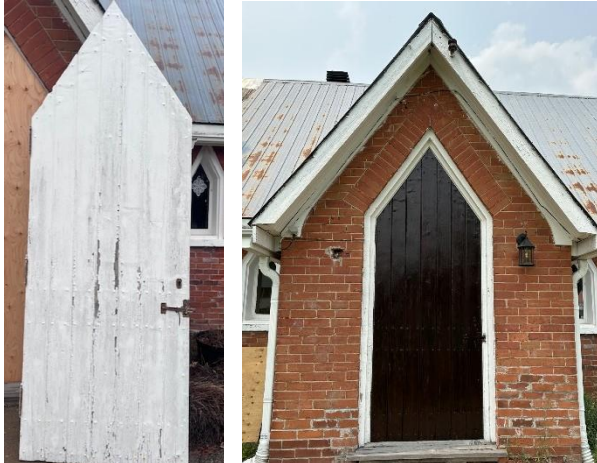
St. Aidan’s Church door before and after restoration.

This year we completed the restoration of the door on St. Aidan’s Church and replaced the door on the Exhibit Hall.