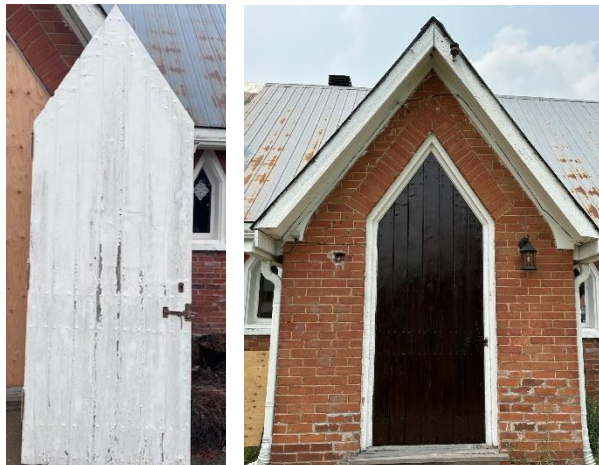
St. Aidan's Church door before and after restoration.

This year we completed the restoration of the door on St. Aidan's Church and replaced the door on the Exhibit Hall.