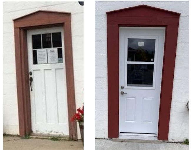
Exhibit Hall – old door and new door